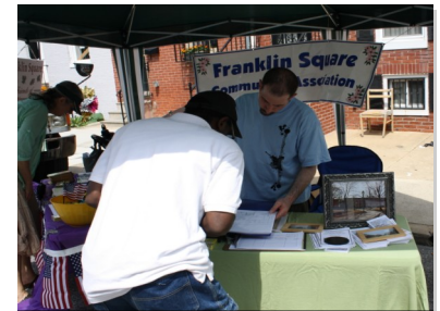
Neighbors signing up for the Franklin Square newsletter at SOWEBO fest

Franklin Square kicked off summer at the SOWEBO festival. We spent the day meeting people and showing off the historic architecture and all the cool stuff we are doing. We highlighted the Blank Lot project on Carey St, which, by the way, we were just informed this week that we will be a recipient of the Neighborhood Grants Program by the Baltimore Community Foundation. YEAH!! Thanks to everyone that helped us.