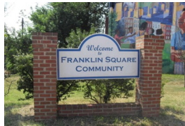
Franklin Square Sign

Advertising in the community newsletter is a great way to reach local homeowners and renters. Support Franklin Square Community Association, help to fund our newsletter, and promote your business at the same time.